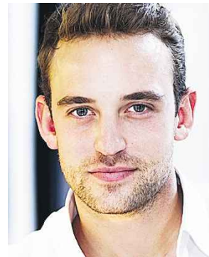
Joel Dicker's "The Truth About the Harry Quebert Affair" is a European bestseller.

Typical of this book is the long-dead character at its center: a 15-year-old blond nymphet, whom we meet "barefoot by the ocean, her sandals in her hand, dancing in the rain and skipping in the